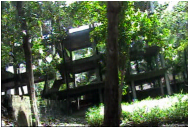
Bisharah Dormitory in 2006

A picture of the Bisharah Renovation Project remarkable progress! Praise the Lord!!