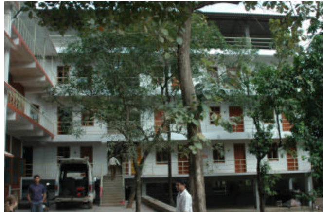
Renovated Bisharah Dormitory in 2007